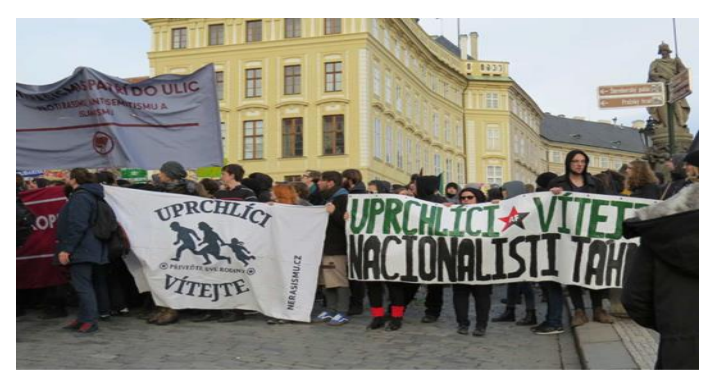
Anti-nationalist event with the participation of anarchists in Prague, 6 February.

After partial activation from previous years, there was a slight stagnation of the anarchist scene, especially its militant part, in 2016. The anti-authoritarian groups were still fragmented, and there was no significant figure or collective to unite them. The membership base remained weak.