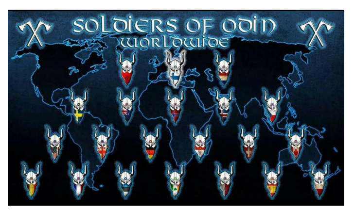
In October 2015, an initiative Soldiers of Odin was founded in the citiy of Kemi. First, it spread across Scandinavia, and later it reached other countries (including the Czech Republic). The founders officially distanced themselves from extremism; however, association with the neo-Nazi scene can be registered in some countries.

Street demonstrations that encountered conflicts between individual ideological groups were also recorded in Finland. During an event, which was organized by a group called the Finnish Resistance Movement, a passer-by who expressed disagreement with the ideology of the movement was attacks by a supporter of the extreme right. The injured twenty-eight-yearold man died a week later. The police subsequently detained the suspected activist of the Finnish Resistance Movement and the court found him guilty of the offence grievous bodily harm resulting in death in December.