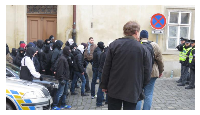
Incident in Thunovská street in Prague on 6 February. Criminalist in the background ("a man in a brown jacket").

Persistent topics for right-wing extremists were anti-immigration activities and anti-Muslim appearances in 2016. Due to the gradual "decrepitation" of the topic, they mostly considered it in a wider context – such as the disagreement with the EU, protest against current political representation, opposition against human rights defenders, leftist intellectuals, etc. Most of the other topics (e.g., former intense anti-Roma rhetoric) have receded in the background; however, on the right occasion, they were quickly "dusted" by the right-wing extremists (see, for example, the aforementioned extreme situation linked to the death of a Roma in Žatec).