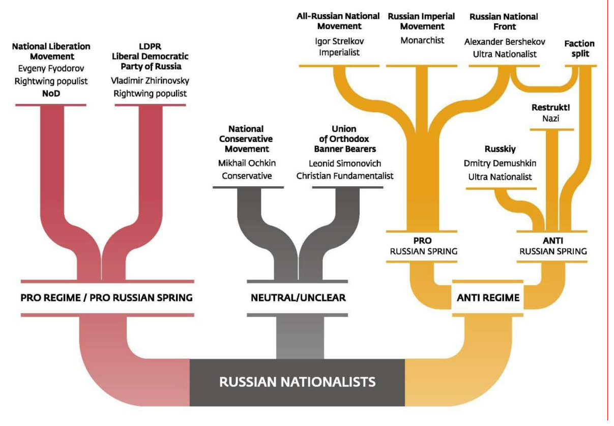
Symbolic indication of individual directions of Russian extreme right.

In Russia , the division of extreme right into the pro-Putin and anti-Putin part persisted. Right-wing extremists organized the traditional Russian March in several cities on 4 November. One of the participants of the march in Moscow was also carrying the Czech flag. It was an expression of solidarity among the Slavic nations, and other participants were carrying flags of other states with the dominant Slavic population. In 2016, a number of violent acts against immigrants committed by members of various extreme right streams were carried out in Russia.