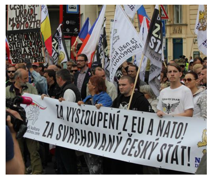
May Day ND event against "traitors".

The ND party continued to engage in radical manifestations of hatred against various groups of people based on their political and religious beliefs, racial or ethnic origin, or sexual orientation. Often, anti-Semitic elements were characteristic for its activities in the form that has been associated with neo-Nazi activists in the past. ND persistently defined itself against the principles of liberal democracy and referred to itself to as an "anti-system" entity.