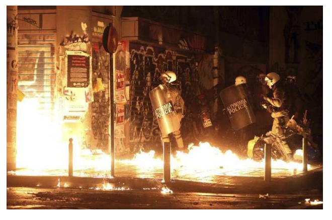
Violent incidents during the visit of the US President Obama, which were largely participated by amarchist groups.

Similarly to previous years, it was possible to record militant demonstrations with violent clashes between the anarchists and the police in Greece. A higher number of serious public unrest occurred, for example. on the occasion of the anniversary of the death of Alexis Grigoropoulos on 6 December (a young man killed by the police in 2008).<sup>10</sup> In response to the detention of three individuals suspected of involvement in violent clashes during the mentioned demonstration, the anarchists subsequently destroyed three trolleybuses of the municipal transport in Athens (first, they