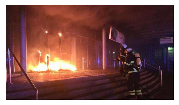
Intervention of firefighters in "Hamburg Messe", the site of the G20 Summit in 2017, after the attack by German anarchists (source: Bild).

From events of <u>German anarchists</u> we can mention, for example, the ignition of 9 vehicles in German Mülheim an der Ruhr in the middle of February as a protest against these "toxic machines" that destroy the environment. One of the most serious incidents was the ignition of 18 military vehicles of the German army in Bremen in November, which caused damage of 15 million Euros. In relation to the German extreme left, it is also worth mentioning that during 2016, the Spanish police arrested anarchists suspected of bank robbery in Aachen, Germany, which took place in November 2014 (these individuals were later handed over to Germany and charged by the German authorities). In connection with this event, several Dutch anarchists were also detained and handed over to prosecution in Germany. In the Netherlands, Spain and other countries, it was possible to record "solidarity actions" with the detained perpetrators as a reaction to these arrests (i.e., destruction of 8 cash machines in the Hague in July).