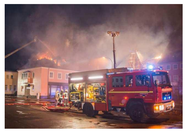
Burning accomodation facility for refugees in Bautzen.

The topic of the rise of the extreme right and increasing attacks arising from the ideology of right-wing extremism was particularly discussed in Germany in 2016. Therefore, a gradation of manifestations of hatred had again been recorded, including a number of isolated attacks on foreigners as well as deliberate arson attacks on accommodation facilities for incoming migrants. As an example of the increased tensions due to the migration crisis can serve the escalated situation in the East German city of Bautzen (located near the Czech border), where unknown offenders ignited a hostel in