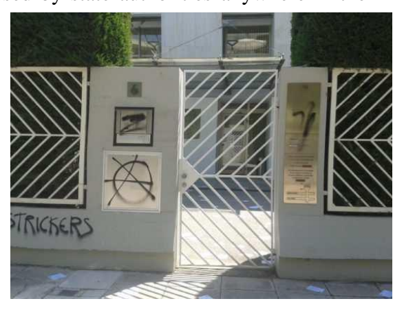
The Czech Embassy in Athens after an attack by the Greek Anarchists.

world (also the activities of the Network of Revolutionary Cells have been linked to solidarity with imprisoned anarchists beyond the borders of the Czech Republic and information about them were given within the campaign of the Anarchist Black Cross). Solidarity with Czech criminally prosecuted anarchists was expressed mainly by minor demonstrations in 2016 (e.g., in front of the Czech Embassy in Moscow in May), organizing concerts (e.g., in Edinburgh in November), leaflets (in St. Petersburg in June) and "solidarity greetings" (e.g., via posted banners, which could be recorded in Minsk or Athens). One of the most serious responses was spraying on the Czech Embassy in Athens by a local anarchist, who this