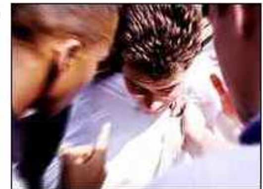
Cyber bullying is "cruel and relentless," says Mr Johnson

The education secretary says web publishers have a "moral obligation" to cut offensive videos of people being attacked, harassed or ridiculed.